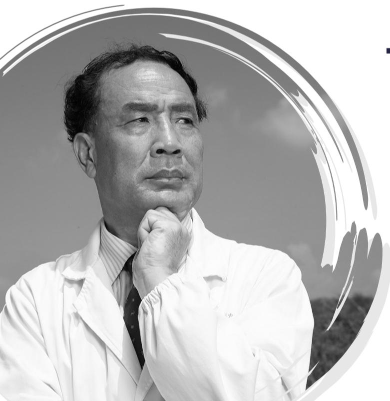
Zhang Yongzhen Chinese Virologist

Zhang Yongzhen was the first to post the genome of the COVID-19 virus online for public access. His laboratory sequenced the virus in just 40 hours and was able to determine it was related to SARS.